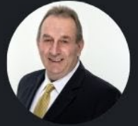
Ron Kostyshyn NDP Minister & MLA - Dauphin