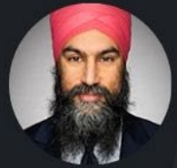
Jagmeet Singh Federal NDP Leader