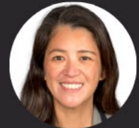
Malaya Marcelino Minister of Labour