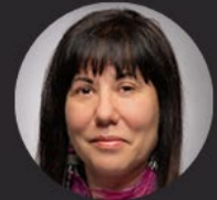
Leah Gazan MP - Winnipeg - Centre