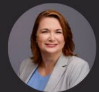
Bea Bruske President, Canadian Labour Congress