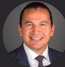
Wab Kinew Premier of Manitoba